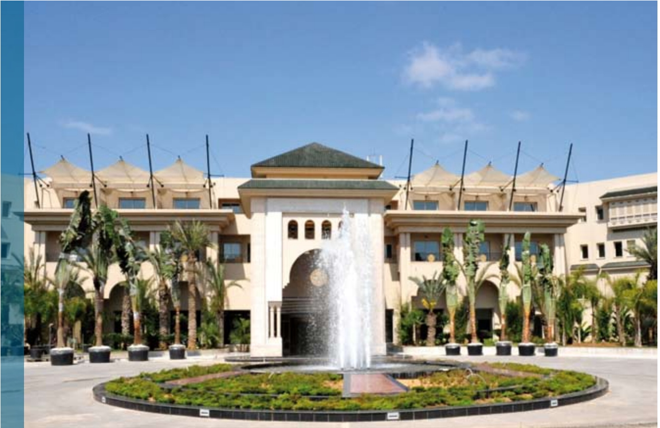
Tertiary Sector Hotel Buildings, Russelior Hotel. Demonstration projects in Tunisia