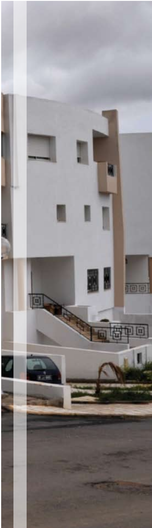
Residential Sector. Luxury Housing. Jinenes Ennasr. Demonstration projects in Tunisia