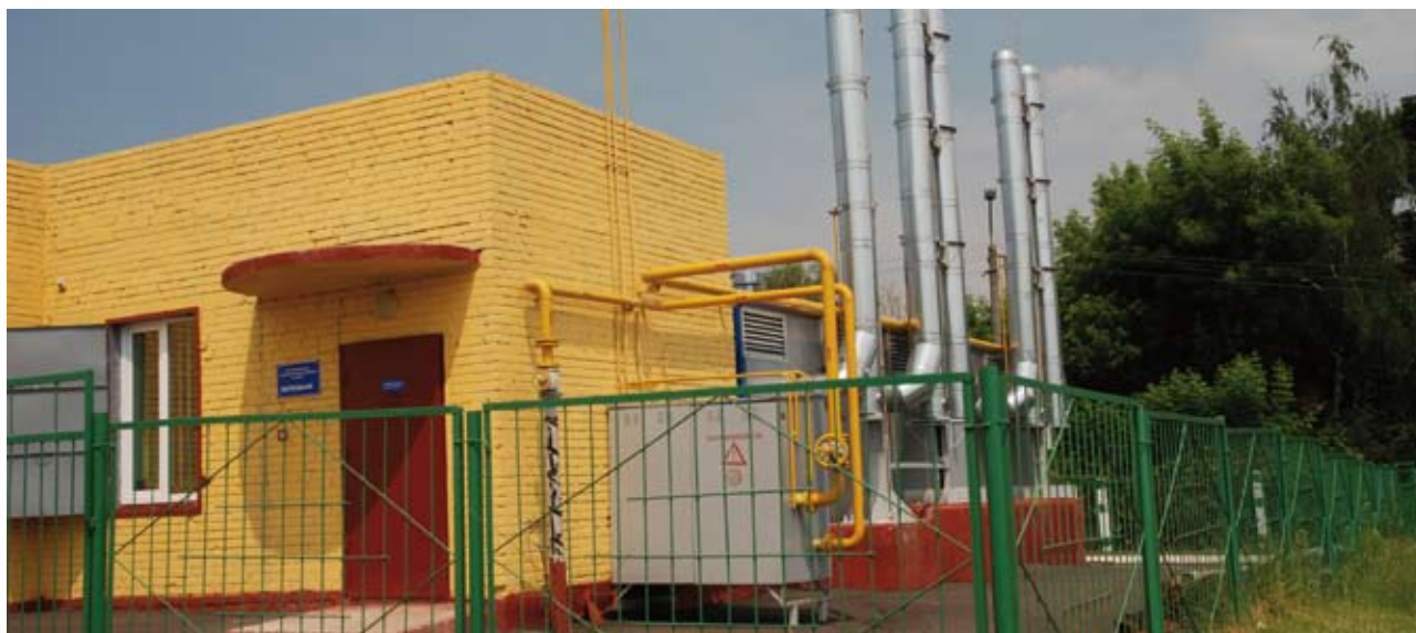
UNDP-GEF Project, “Removing Barriers to Greenhouse Gas Emissions Mitigation through Energy Efficiency in the District Heating System in Ukraine”. Module type individual boiler plant constructed for Humanitarian Gymnasium Complex and Swimming pool in the city of Rivne, Ukraine, in 2008, allowed avoiding significant heat losses at utility’s 2km manifolds and secured first comfort winter for schoolchildren and teachers since 1994.