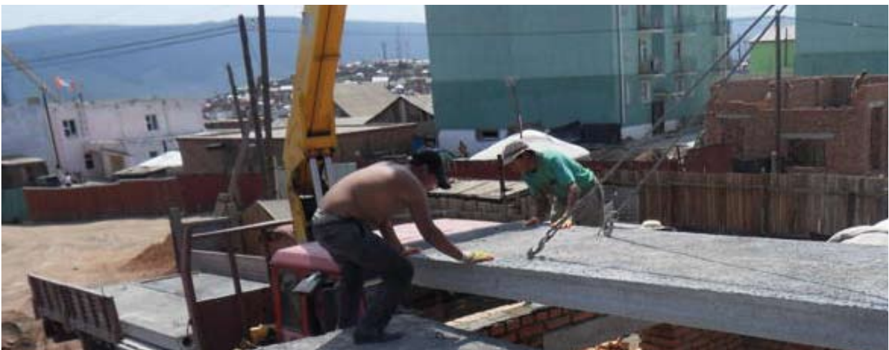
Energy Efficiency Buildings in Mongolia: Concrete board roofing for a brick house

In Europe, several national or international networks—such as MUNEE (Municipal Network for Energy Efficiency – Central and Eastern Europe), Energie Cités (24 European countries), and EcoEnergy (Bulgaria)—disseminate best practices, tools, and experiences between municipalities. Smaller networks of similar buildings (hospitals, schools, etc.) at the level of the city or the region can also be very effective in bringing practical improvements in the daily operation of buildings. These networks generally organise monitoring schemes, provide benchmarks, and share technical and human resources amongst members as well as pooling procurement to lower costs.