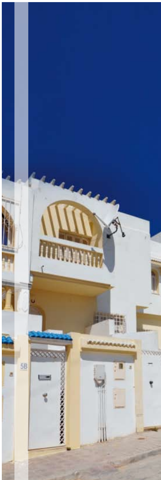
Residential Sector Welfare Housing, Smit. Demonstration projects in Tunisia